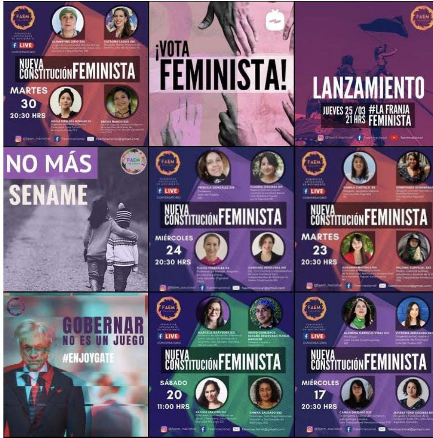
Figure 1. Feminist Women’s Movement.

Parity CI, represented in the table by paragraph 9, is a space that also had Facebook, Instagram, a website with a declaration of principles where they maintain that it is an open space for women to apply for a new constitution in a feminist key that integrates the rights of women, children, adolescents, and LGBTIQ+ communities, in addition to maintaining a socio-environmental, plurinational and intercultural focus. Their platforms include descriptions of the candidacies concerning their lists, parties, districts, axes, and political trajectories. It should be noted that not all nominations are integrated into the web platform and the candidates by district.