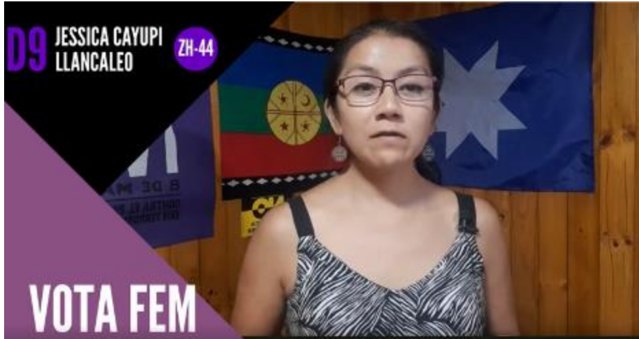
Image 3. Original Peoples Movement.

Only in the case of the Plurinational Strip is there an evident cross-cultural allusion visible in the name and the participation of candidates for reserved seats. But it is worth distinguishing that it was a space shared with candidacies of the social movement with a strong focus on Mapuche's identity. Still, it is not exclusive to the indigenous.